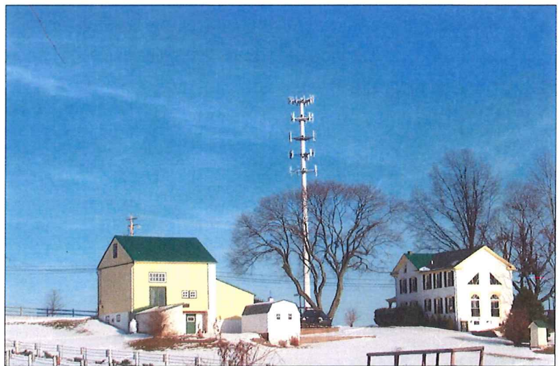
A new wave of cell towers are going up across the county. What will the impacts be to historic resources, contexts, and views?

The Chester County Historic Preservation Network is an affiliation of local organizations and individuals dedicated to promoting, protecting, and preserving Chester County's historic resources and landscapes through education, facilitation, and public and private advocacy.