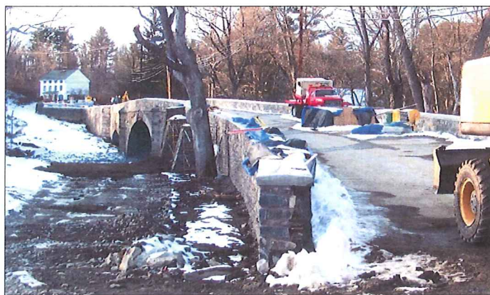
The rehabilitation of Cope's Bridge by PennDOT involved extensive participation by Consulting Parties in the Section 106 Review process to ensure its historic character was retained.

Consultation is the cornerstone of the Section 106 process. Agencies initiate Section 106 reviews in consultation with the State Historic Preservation Officer and, when historic properties of significance to federally recognized Indian tribes are involved, with tribal officials. Federal agencies are also required to include local governments and applicants for federal assistance, permits, licenses, and other approvals in the process. Other consulting parties may include a wide range of individuals or groups interested in historic preservation.