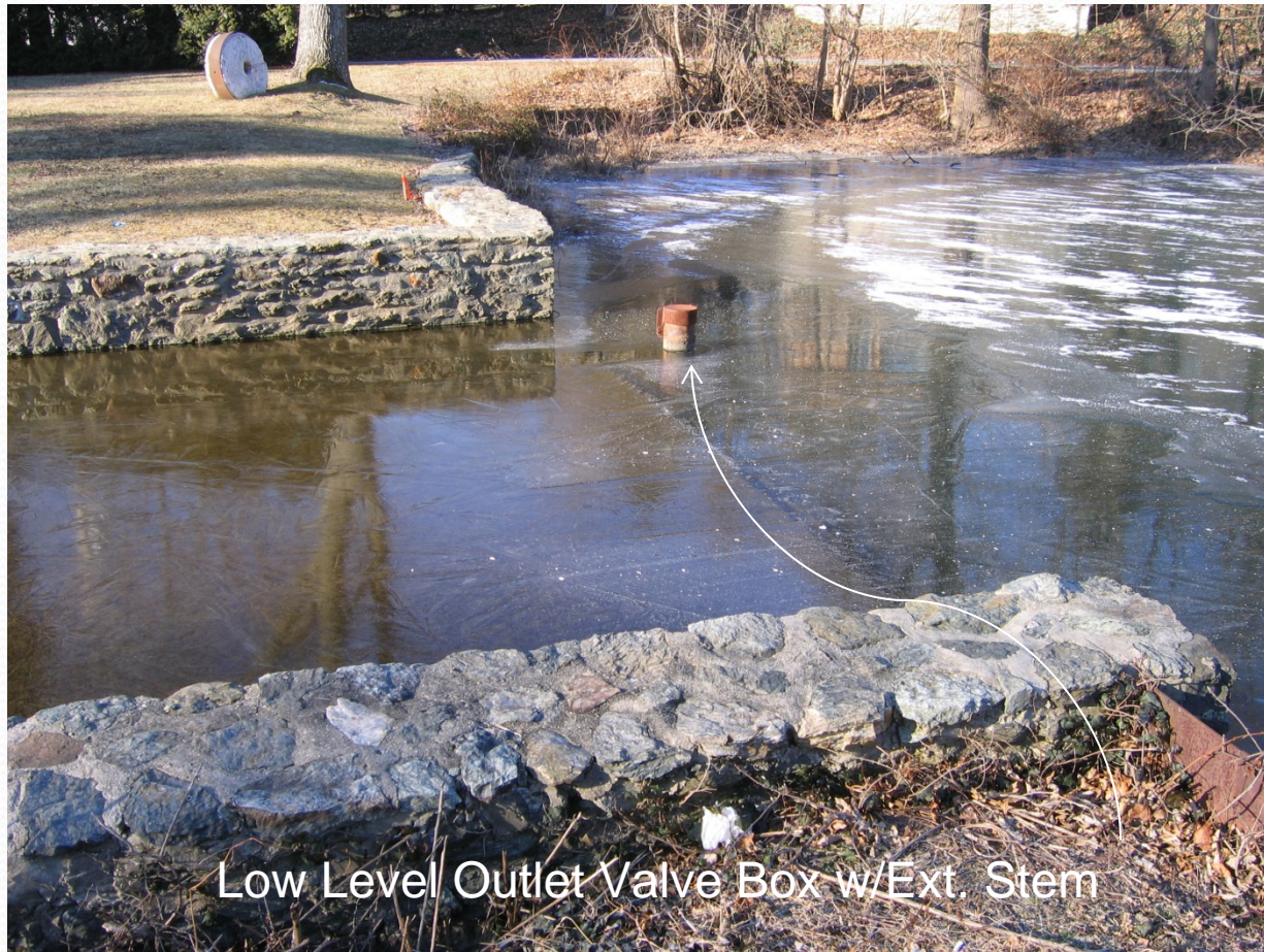
Low Level Outlet Valve Box w/Ext. Stem