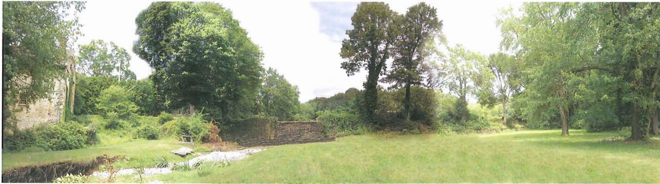
EXISTING SITE VIEW