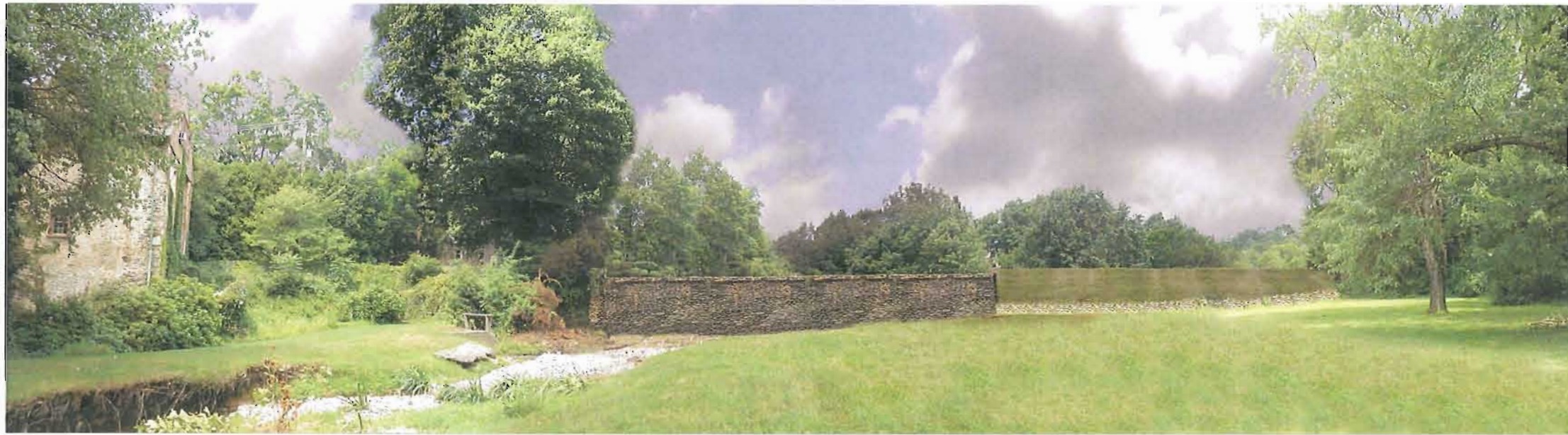
PROPOSED SITE VIEW