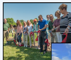
Pollinator Garden installed through WCGC partnership