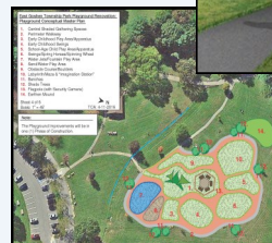
Kid-designed accessible destination playground