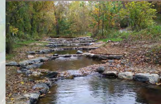
Example Constructed Waterfall / Step Pools

Simone Collins Landscape Architecture + Princeton Hydro