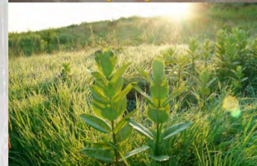
Low Meadow Plantings – sedges and milkweed

Simone Collins Landscape Architecture + Princeton Hydro