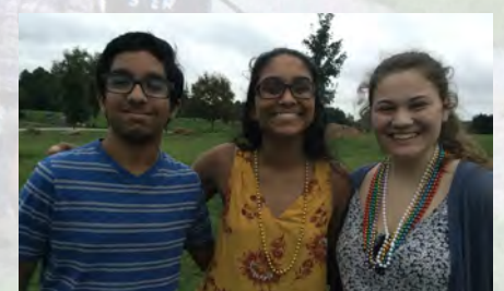
Advisory Committee Members (L-R):