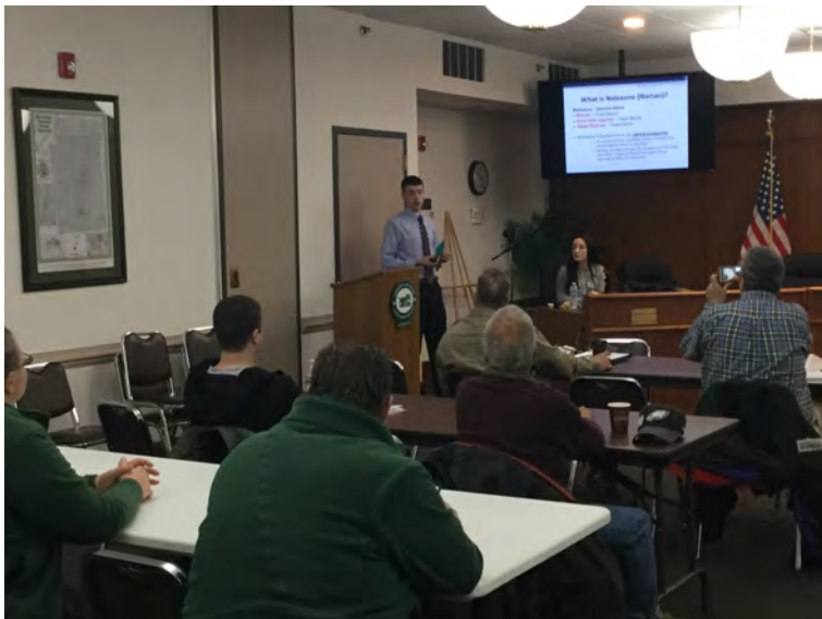
Naloxone training at the Township Building, March 2018

The Department Director also recently served on the 2018 DCNR/PRPS Leadership Summit Planning Committee. This once per decade summit brings leaders together to identify and address emerging issues in the parks and recreation field. He was the Lead Writer for the Health and Wellness paper, leading problem-solving discussions concerning obesity, community walkability, opioids and health care system partnerships.