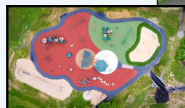
Kid-designed accessible destination playground