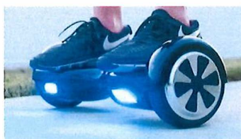
A. Hover board (8)