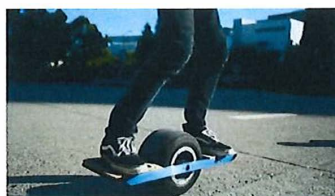
B. One wheel (19)