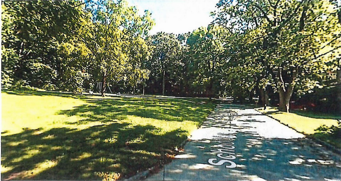
Current Milltown Park