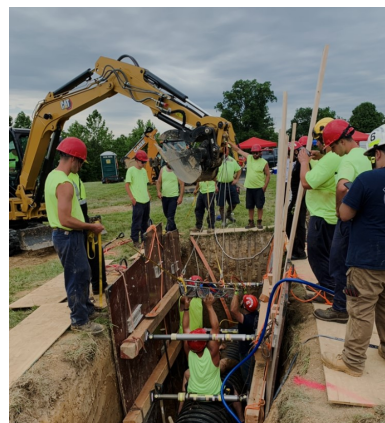
Public Works Dept leading Trench School training