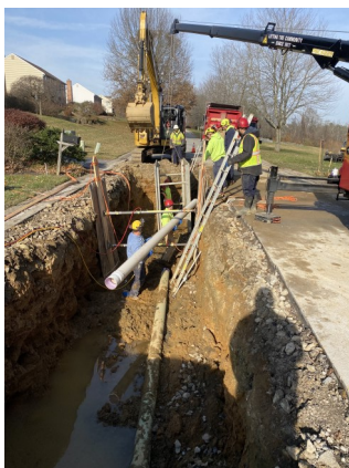
Sewer line repair on Bow Tree Drive

Any questions may be directed to members of the East Goshen Municipal Authority, which meets monthly on the second Monday of the month at 7:00p.m. in the Township Building.