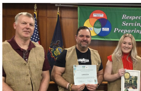
Lavazza being recognized as a founding business in the Township's Sustainable Businesses Program