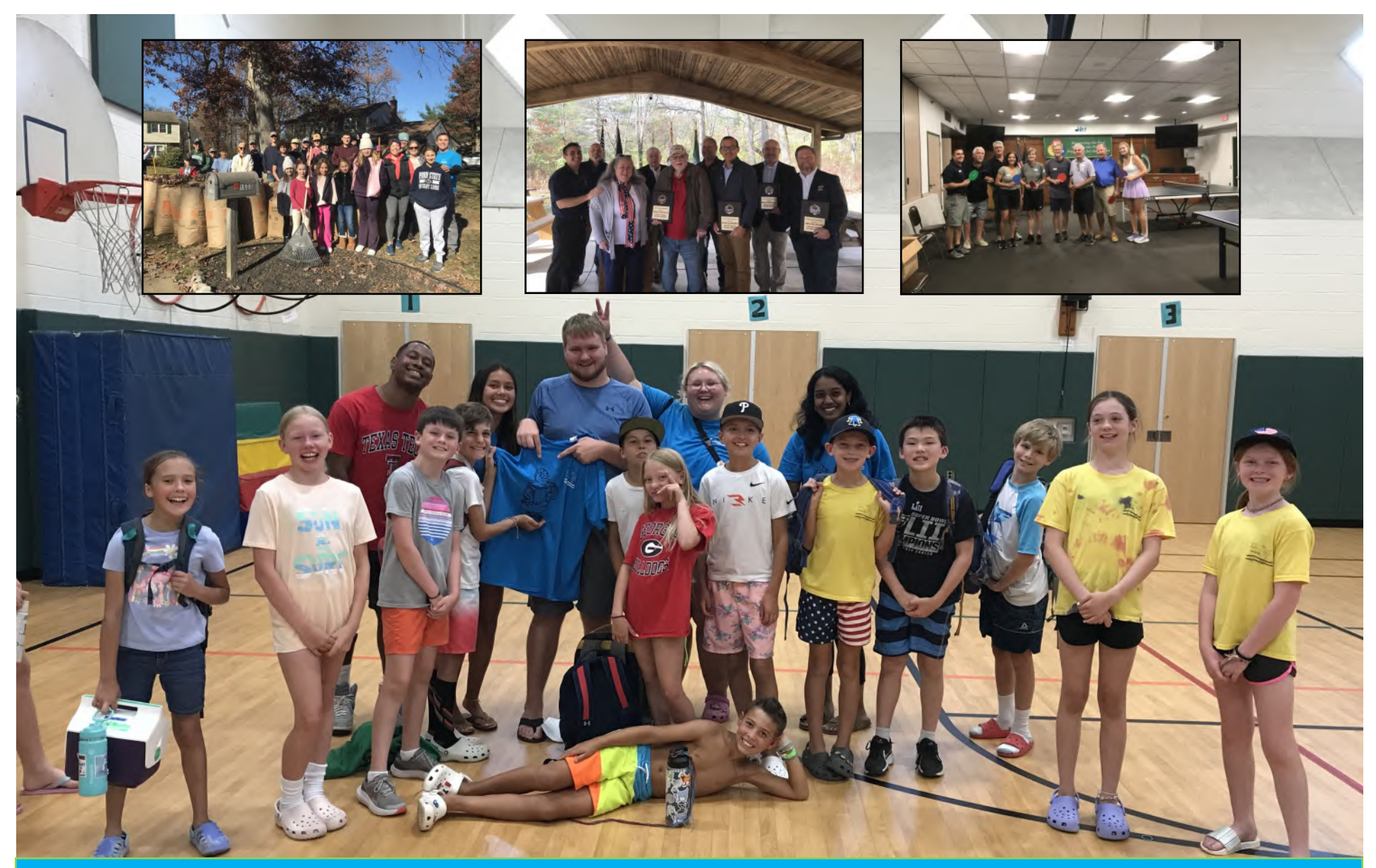
East Goshen Township, Department of Parks and Recreation End of Year Report 2024