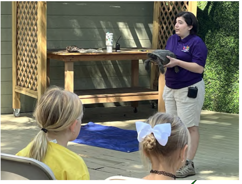
Learned a little something?