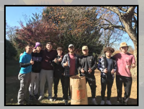
2024 EGTPR Volunteer Org. of the Year

Over forty community partners dedicate time, energy and resources to help EGTPR pull off a full year's worth of programming and special events in the park!